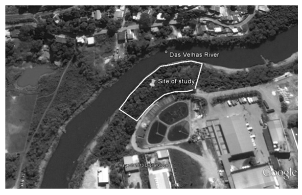
Figure 1 – Satellite image of the region where the studied riparian zone is located (highlighted) at the Das Velhas River, Sabará, Minas Gerais state, Brazil. Figura 1 – Imagem de satélite da região onde está localizada a mata ciliar estudada (em destaque) no leito do rio das Velhas, Sabará, Minas Gerais.

Source: Google Earth, Image date: June 30th, 2012. Fonte: Google Earth, data das imagens: 30/06/2012.